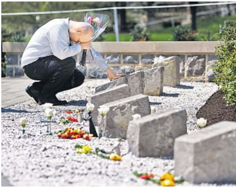
A man grieves at a memorial of 32 granite blocks representing each of the people killed by Cho Seung-Hui at Virginia Tech in Blacksburg, Virginia. The one-year anniversary of the worst school shooting in US history is on Thursday