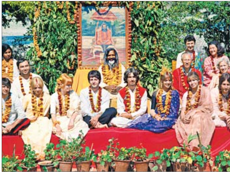
Paul Saltzman's images of the Beatles in Rishikesh

Saltzman's exhibition in association with the Indo American Arts Council opened at the weekend at the Morrison Hotel Gallery. It has 25 images of the Beatles and visitors can buy signed limited edition prints for $4,500 to