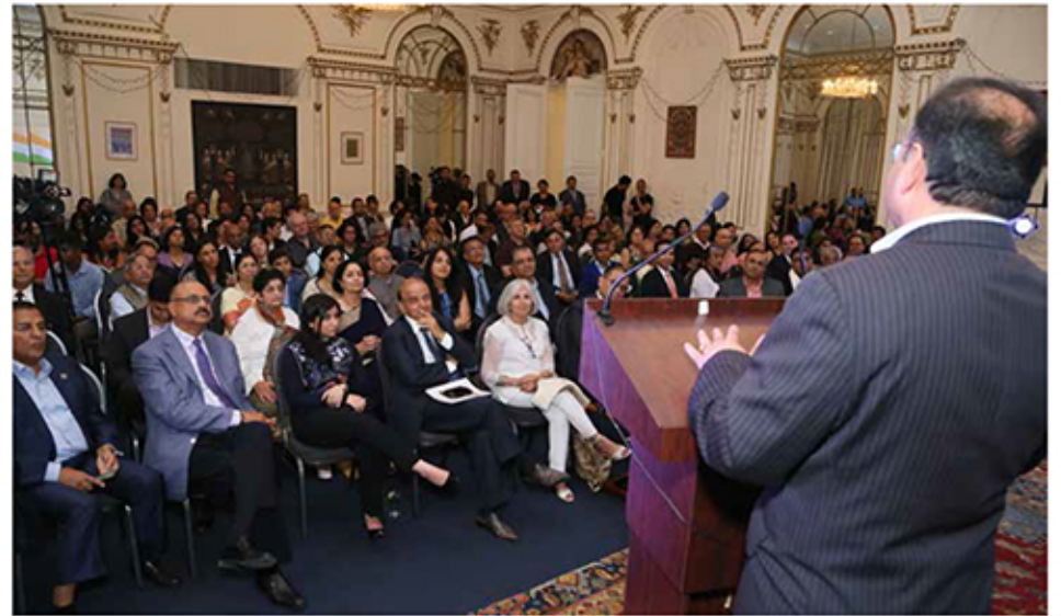
The gathering at the Consulate