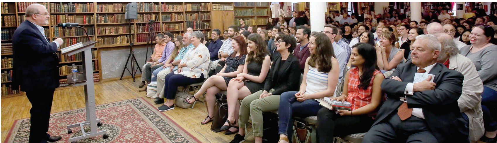
Salman Rushdie reads passages from his latest book, "The Golden House" at Strand Bookstore in New York on June 26