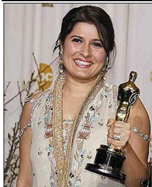
Sharmeen Obaid winning the honours for her astounding work in short film 'Saving Faces'